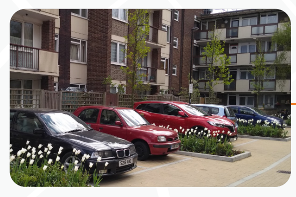
Parking within secure courtyards to be used by residents of the surrounding homes