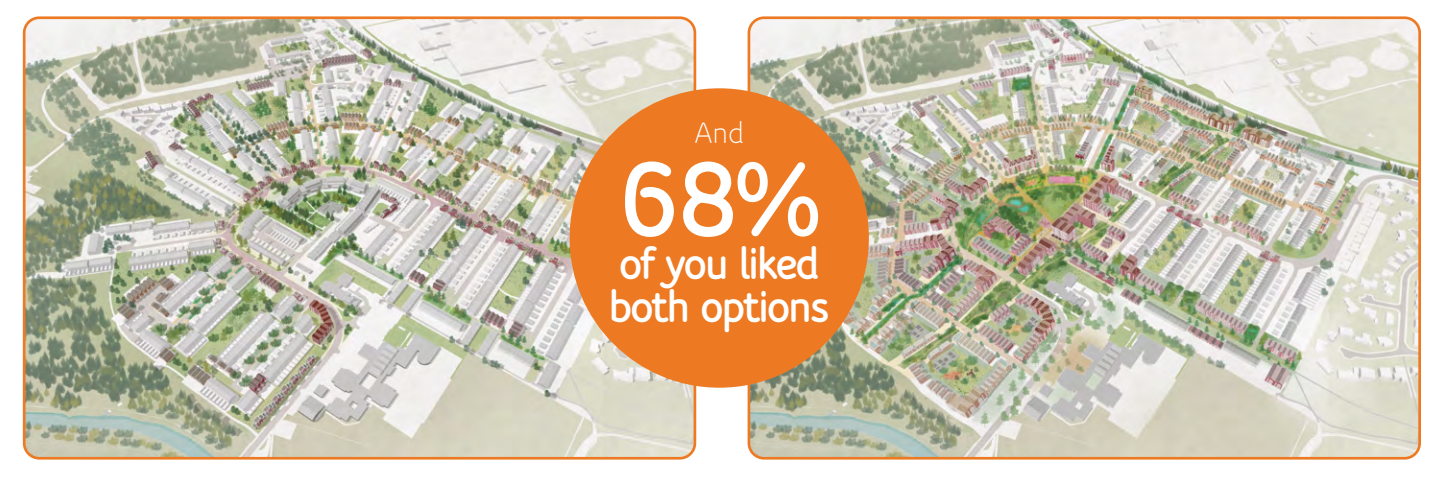
Transforming the garages

770/0 of you liked the idea of the route to the riverside